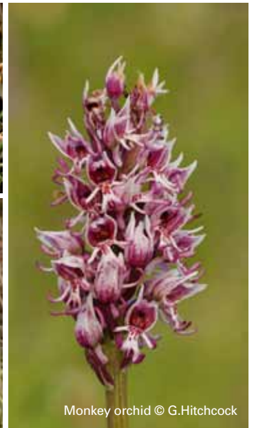
Monkey orchid