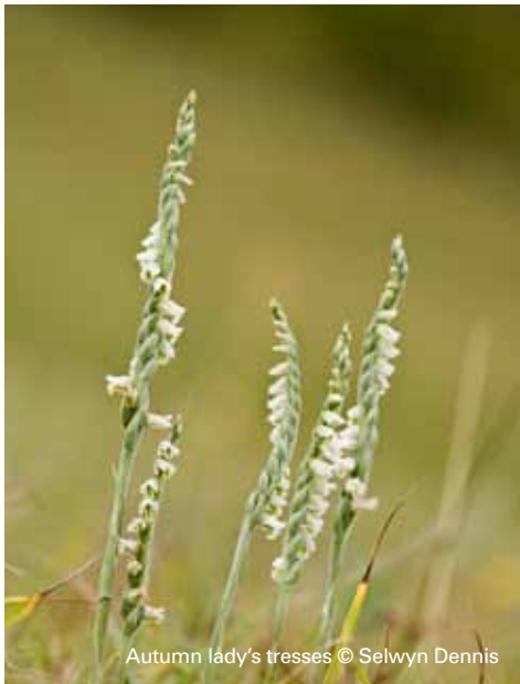
Autumn lady's tresses © Selwyn Dennis