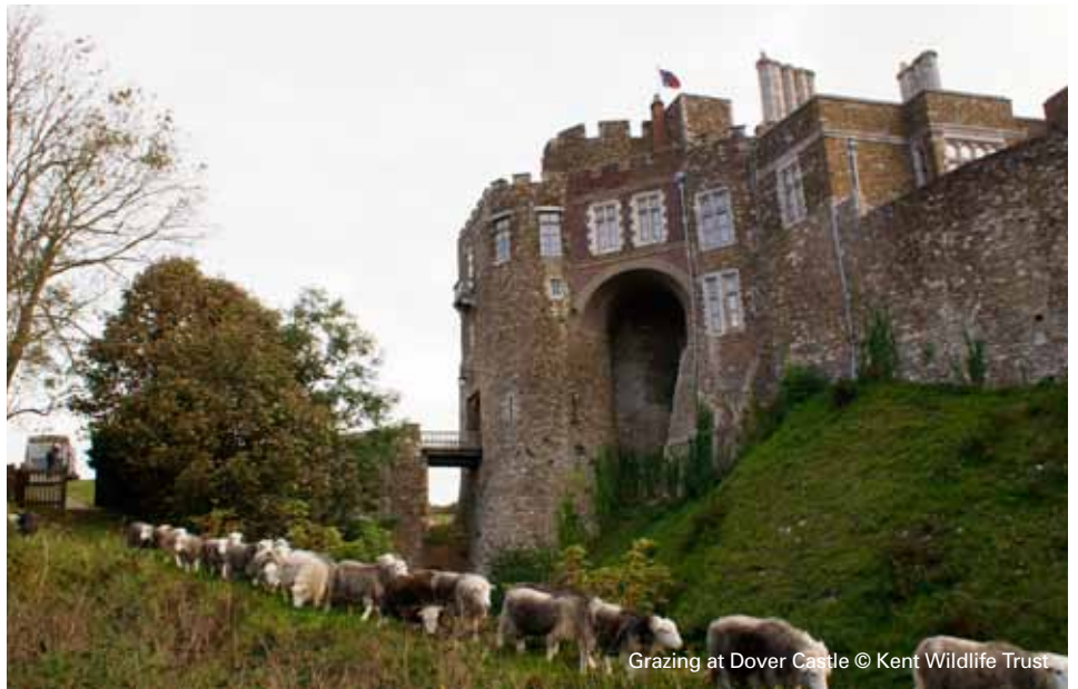
Grazing at Dover Castle

be able to achieve the same diversity of micro-habitats as you would on a larger site, where grazing and cutting can be rotated and cutting heights varied from year to year, thus creating mosaics of short grass, taller grass, and tussocky grass