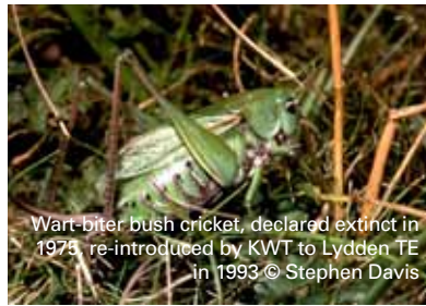
Wart-biter bush cricket, declared extinct in 1975, re-introduced by KWT to Lydden TE in 1993