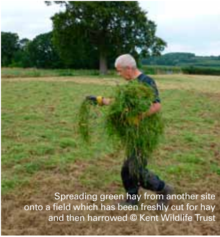
Spreading green hay from another site onto a field which has been freshly cut for hay and then harrowed