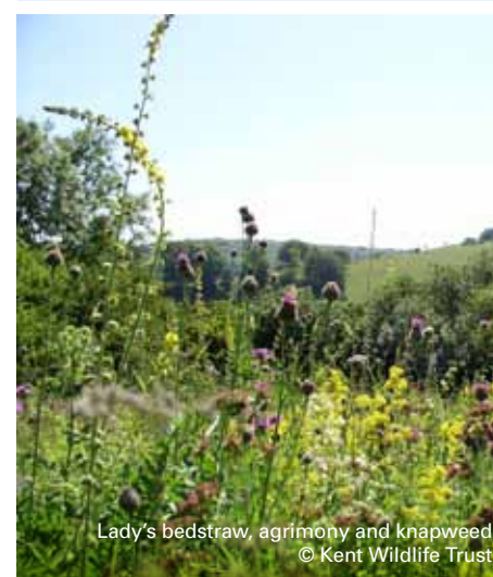
Lady’s bedstraw, agrimony and knapweed