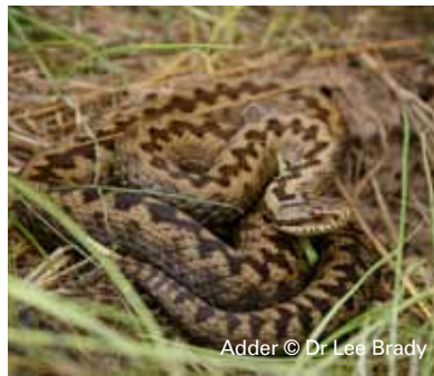
Adder