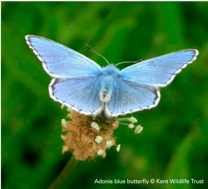
Adonis blue butterfly