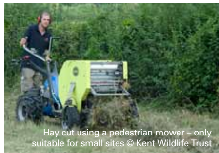
Hay cut using a pedestrian mower – only suitable for small sites