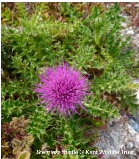
Stemless thistle