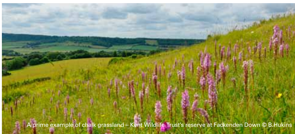
A prime example of chalk grassland – Kent Wildlife Trust’s reserve at Fackenden Down

This leaflet is designed to give owners of chalk grassland some general recommendations on how to manage their land and assumes that the primary objective is to manage the land for nature conservation purposes.