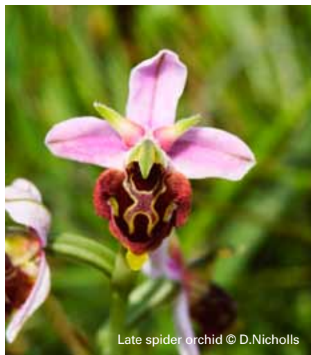
Late spider orchid